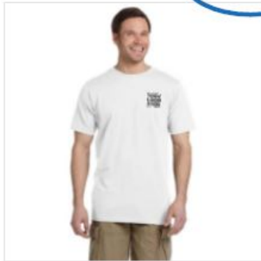
Shirt YLH Image