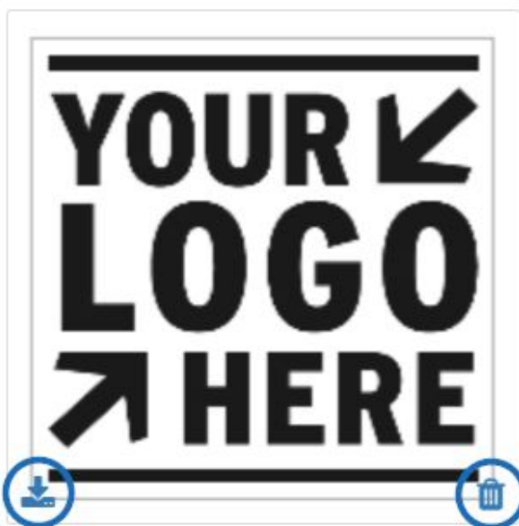
Your Logo Here.png

To upload an additional image or file, click on the Upload button, browse your computer, select the image, and then click on Open. Any images uploaded in this section will be available in the Artwork & Files dropdown section of the Decoration tab when creating orders for this customer.