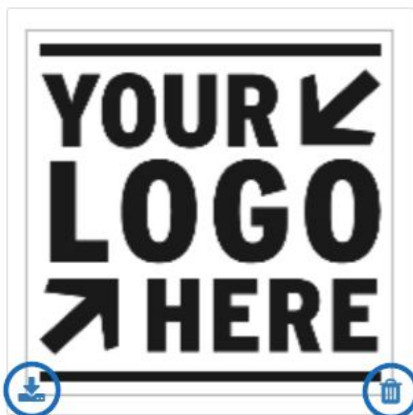
Your Logo Here.png

To upload an additional image or file, click on the Upload button, browse your computer, select the image, and then click on Open. Any images uploaded in this section will be available in the Artwork & Files dropdown section of the Decoration tab when creating orders for this customer.