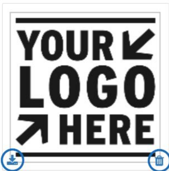
Your Logo Here.png

To upload an additional image or file, click on the Upload button, browse your computer, select the image, and then click on Open. Any images uploaded in this section will be available in the Artwork & Files dropdown section of the Decoration tab when creating orders for this customer.